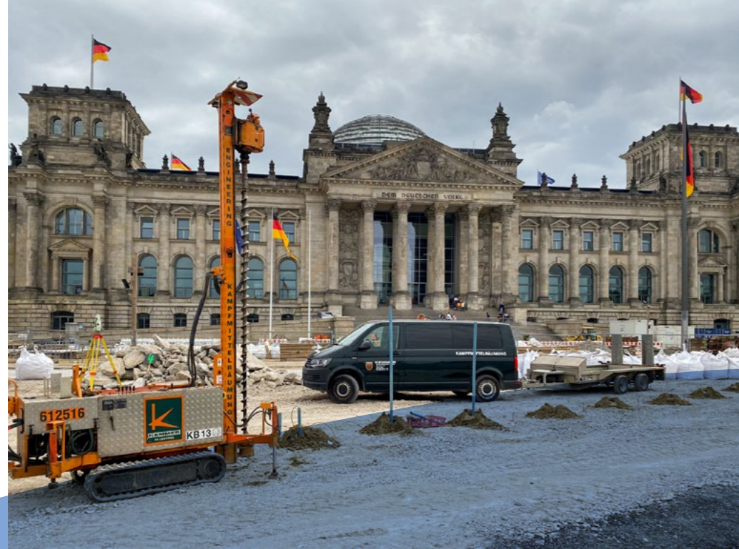
Subsoil exploration and contaminated site remediation