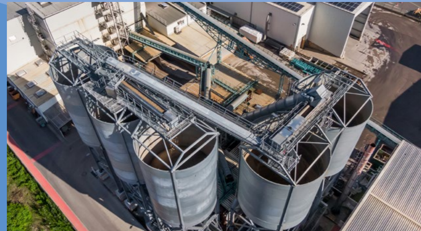
Soil washing plant for cleaning polluted soils and construction wastes