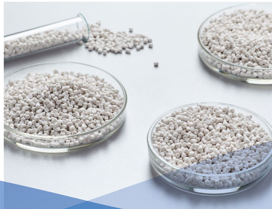
HAPaqua filter material