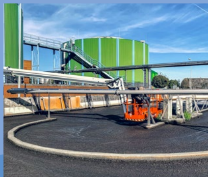
Municipal wastewater treatment and sludge digestion