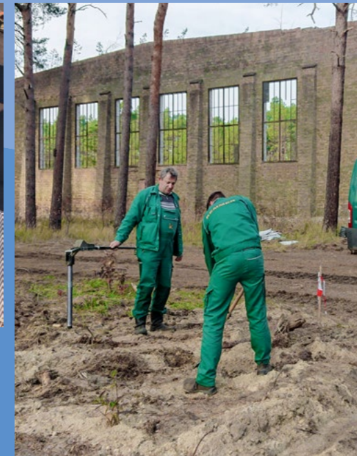
Ammunition clearance and disposal