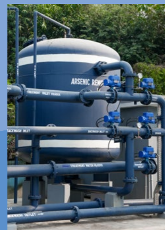
Arsenic and fluoride removal