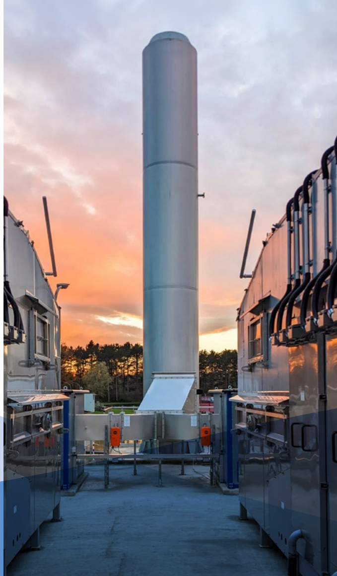
Exhaust air treatment and odor elimination