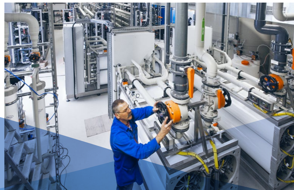
Industrial wastewater treatment, water recycling and ZLD