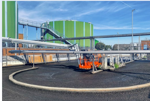
Municipal wastewater treatment and sludge digestion