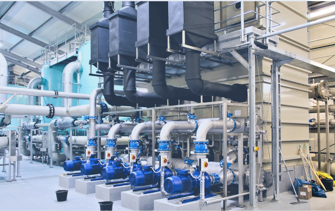
Drinking water treatment