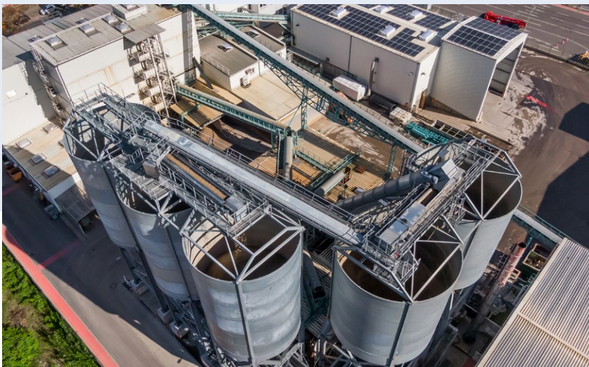
Soil washing plant for cleaning polluted soils and construction wastes