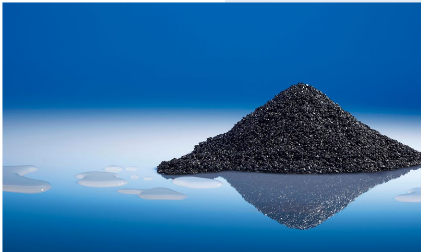
GEH® adsorption material