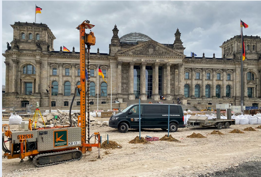
Subsoil exploration and contaminated site remediation