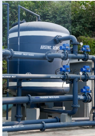
Arsenic and fluoride removal