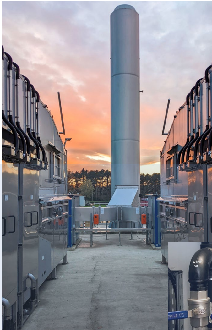
Exhaust air treatment and odor elimination