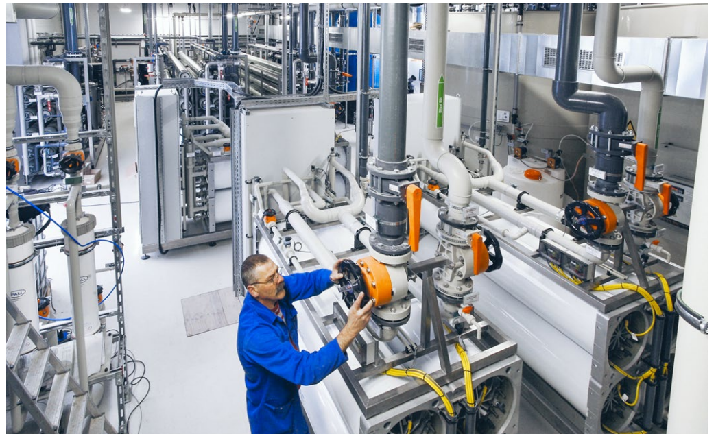
Industrial wastewater treatment, water recycling and ZLD